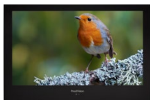
Black - PV24BF-A