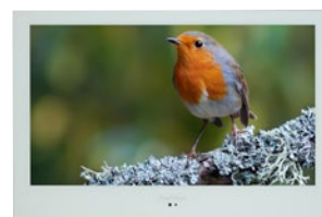
White - PV24WF-A